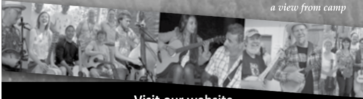
a view from camp

Visit our website www.musiccamp.org for all details and to see our new videos! SCHOLARSHIPS AVAILABLE